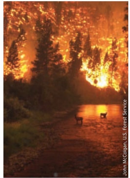
John McColgan, U.S. Forest Service

Similarly, an increase in the frequency of extreme wildfire events in scrub-shrub habitats will exacerbate the expansion of exotic invasive species such as cheatgrass. 27 This could lead to