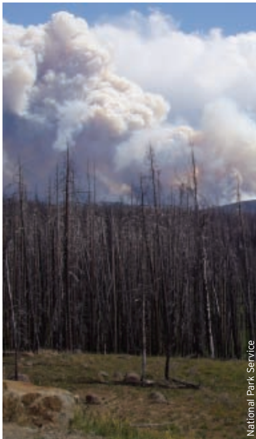
National Park Service

a rapid conversion of habitat types and place native species—including mule deer, pronghorn, and sage grouse—at risk. 28 The introduction of cheatgrass might even make some locations susceptible to more frequent fires. 29